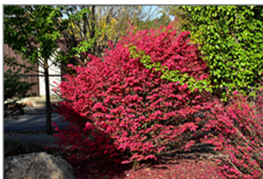
Little Moses Burning Bush in fall