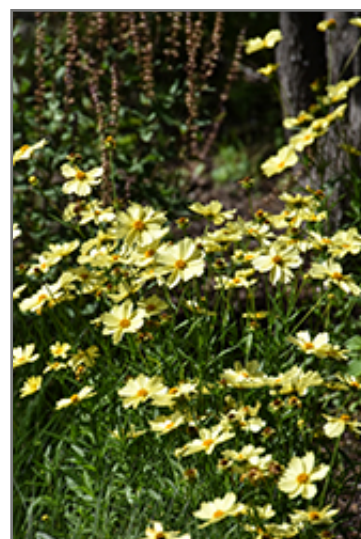
Full Moon Tickseed flowers