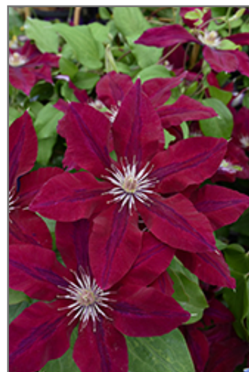
Rebecca Clematis flowers