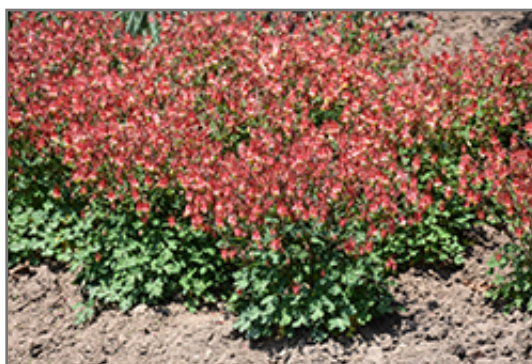
Little Lanterns Columbine in bloom