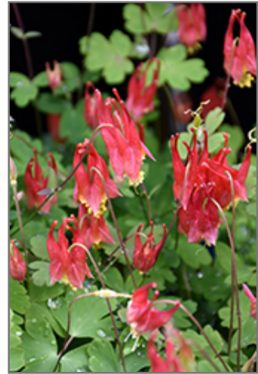
Little Lanterns Columbine flowers

Little Lanterns Columbine is a fine choice for the garden, but it is also a good selection for planting in outdoor pots and containers. It is often used as a 'filler' in the 'spiller-thriller-filler' container combination, providing a mass of flowers and foliage against which the larger thriller plants stand out. Note that when growing plants in outdoor containers and baskets, they may require more frequent waterings than they would in the yard or garden. Be aware that in our climate, most plants cannot be expected to survive the winter if left in containers outdoors, and this plant is no exception. Contact our experts for more information on how to protect it over the winter months.