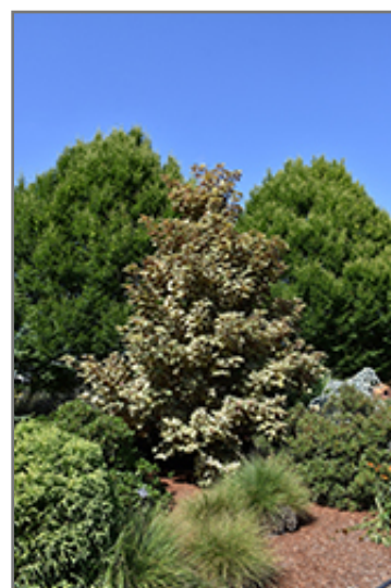
Eskimo Sunset Sycamore Maple