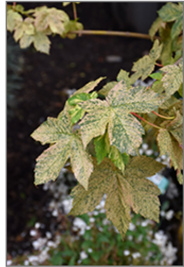
Eskimo Sunset Sycamore Maple foliage

This plant is not reliably hardy in our region, and certain restrictions may apply; contact the store for more information.