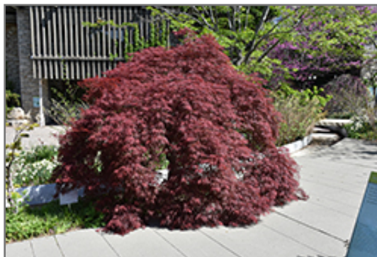
Inaba Shidare Cutleaf Japanese Maple

Inaba Shidare Cutleaf Japanese Maple is recommended for the following landscape applications;