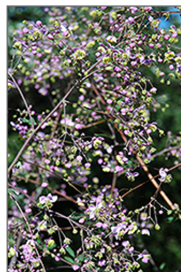
Rochebrun Meadow Rue flowers