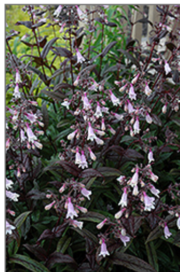
Dark Towers Beard Tongue flowers