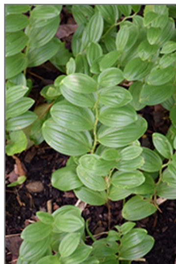
Solomon's Seal foliage