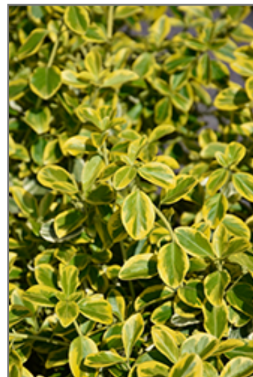
Country Gold Wintercreeper foliage