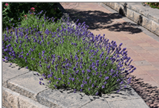
Munstead Lavender in bloom

Munstead Lavender is recommended for the following landscape applications;