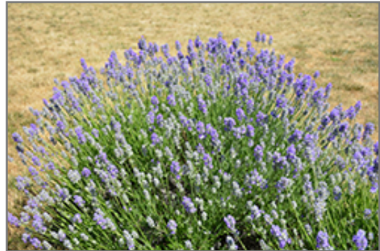
Munstead Lavender in bloom

Munstead Lavender will grow to be about 16 inches tall at maturity, with a spread of 18 inches. Its foliage tends to remain dense right to the ground, not requiring facer plants in front. Although it's not a true annual, this slow-growing plant can be expected to behave as an annual in our climate if left outdoors over the winter, usually needing replacement the following year. As such, gardeners should take into consideration that it will perform differently than it would in its native habitat.