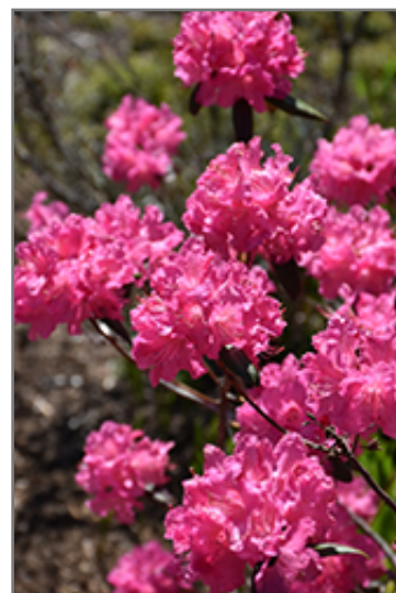
Landmark Rhododendron flowers

Landmark Rhododendron will grow to be about 5 feet tall at maturity, with a spread of 5 feet. It tends to be a little leggy, with a typical clearance of 1 foot from the ground, and is suitable for planting under power lines. It grows at a slow rate, and under ideal conditions can be expected to live for 40 years or more.