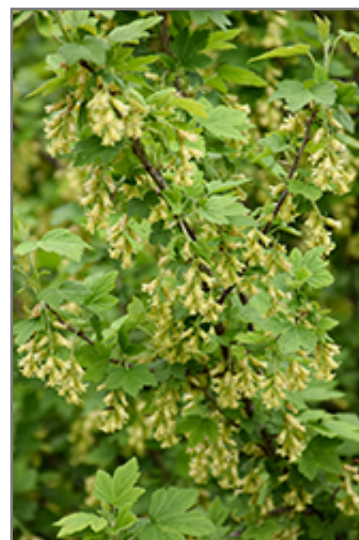
Wild Black Currant flowers