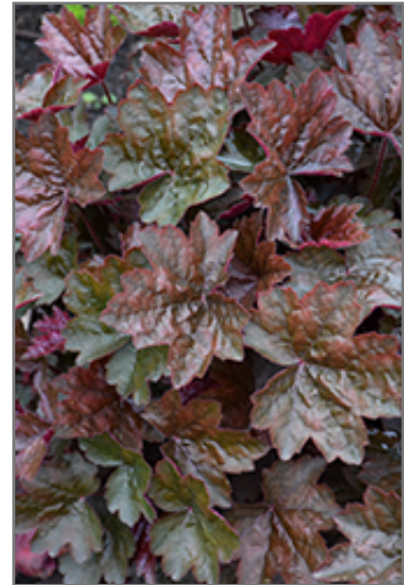
Rachel Coral Bells foliage