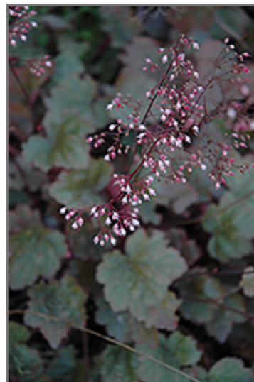
Rachel Coral Bells flowers

This plant is not reliably hardy in our region, and certain restrictions may apply; contact the store for more information.