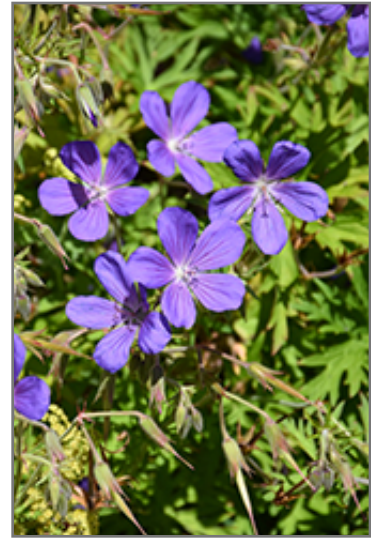
Orion Cranesbill flowers