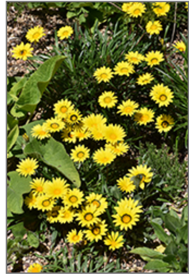
Colorado Gold Gazania flowers

This plant is not reliably hardy in our region, and certain restrictions may apply; contact the store for more information.