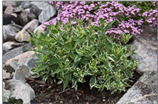
Cool Splash Bush Honeysuckle

This plant is not reliably hardy in our region, and certain restrictions may apply; contact the store for more information.