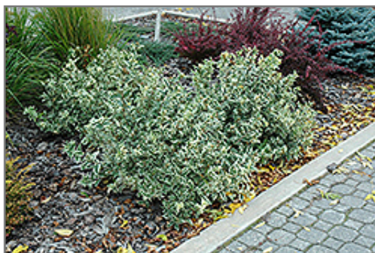
Cool Splash Bush Honeysuckle