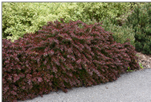
Cherry Bomb Japanese Barberry

Cherry Bomb Japanese Barberry is recommended for the following landscape applications;