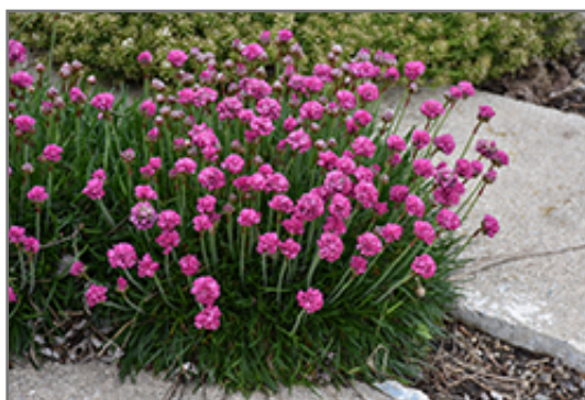
Bloodstone Sea Thrift in bloom