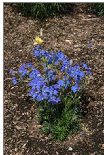
Hunky Dory&Trade; Blue Delphinium in bloom