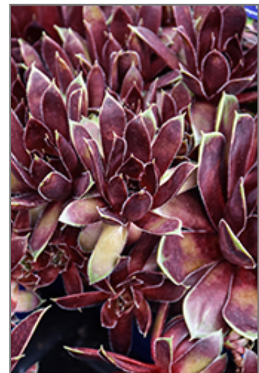
Colorockz Coconut Crystal Hens And Chicks