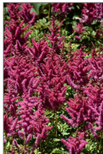
Mighty Red Quin Chinese Astilbe flowers