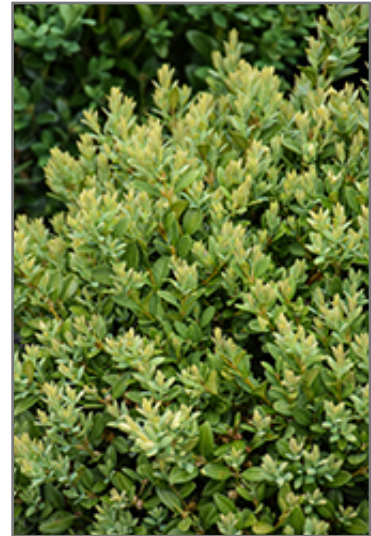
Green Mound Boxwood foliage