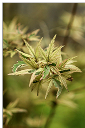
Okukuji Nishiki Japanese Maple foliage