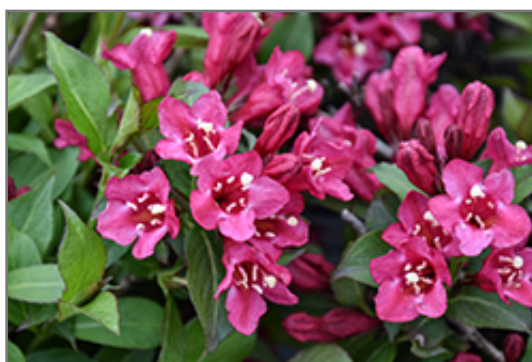
Sonic Bloom Punch Reblooming Weigela flowers