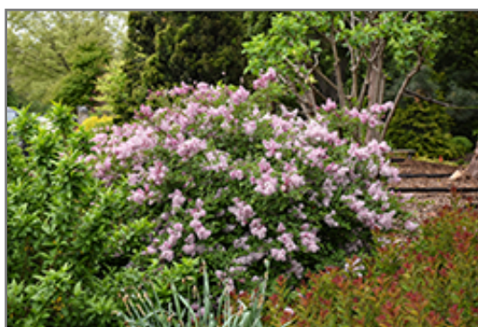
Bloomerang Purpink Lilac in bloom