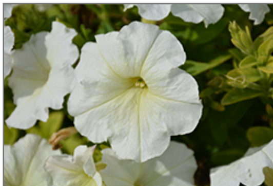
Trilogy Lime Petunia flowers

Trilogy Lime Petunia is recommended for the following landscape applications;