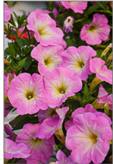
Potunia Plus Baby Pink Petunia flowers