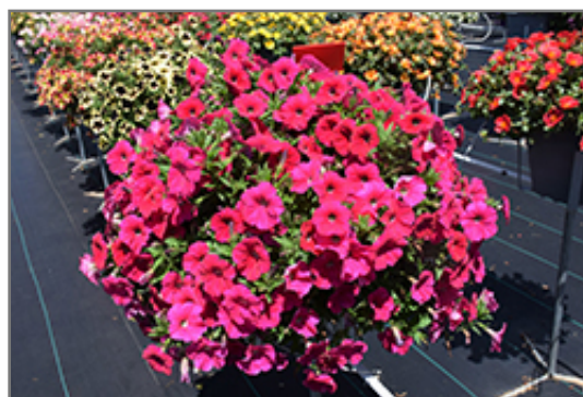
Cascadias Fuchsia Petunia flowers