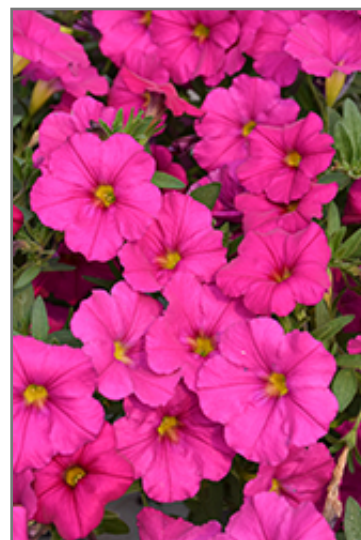
EnViva Pink Petchoa flowers

EnViva Pink Petchoa is recommended for the following landscape applications;