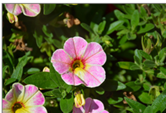
Aloha Nani Pink Blush Calibrachoa flowers