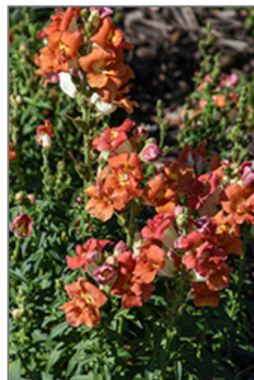
DoubleShot Orange Bicolor Snapdragon flowers