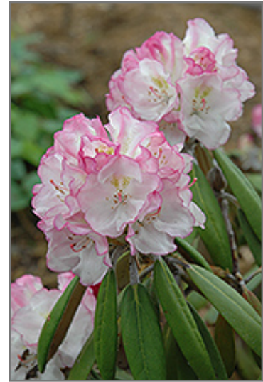
Ken Janeck Rhododendron flowers