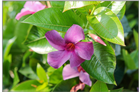
Sun Parasol Bluephoria Mandevilla flowers

This plant is native to the tropics and prefers growing in moist environments with evenly warm conditions all year round. In our climate, it is usually grown as an outdoor annual in the garden or in a container. If you want it to survive the winter, it can be brought in to the house and provided with special care, and then returned to the garden the following season. In its preferred tropical habitat, it can grow to be around 5 feet tall at maturity, with a spread of 24 inches. However, when grown as an annual or when overwintered indoors, it can be expected to perform differently, and its exact height and spread will depend on many factors; you may wish to consult with our experts as to how it might perform in your specific application and growing conditions.