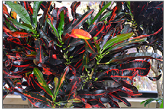
Red Mammy Croton foliage

This plant does best in full sun to partial shade. It does best in average to evenly moist conditions, but will not tolerate standing water. This plant should not require much in the way of fertilizing once established, although it may appreciate a shot of general-purpose fertilizer from time to time early in the growing season. It is not particular as to soil pH, but grows best in rich soils. It is somewhat tolerant of urban pollution. This particular variety is an interspecific hybrid, and parts of it are known to be toxic to humans and animals, so care should be exercised in planting it around children and pets.