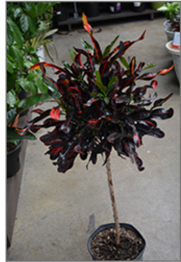
Red Mammy Croton in full

This plant is native to the tropics and prefers growing in moist environments with evenly warm conditions all year round. In our climate, it is usually grown as an outdoor annual in the garden or in a container. If you want it to survive the winter, it can be brought in to the house and provided with special care, and then returned to the garden the following season. In its preferred tropical habitat, it can grow to be around 5 feet tall at maturity, with a spread of 5 feet. However, when grown as an annual or when overwintered indoors, it can be expected to perform differently, and its exact height and spread will depend on many factors; you may wish to consult with our experts as to how it might perform in your specific application and growing conditions.