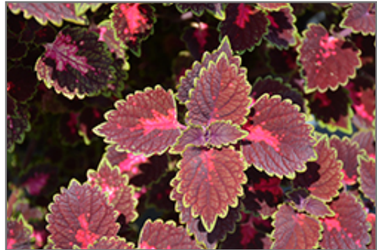
ColorBlaze Cherry Drop Coleus foliage