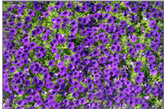
Supertunia Mini Vista Ultramarine Petunia flowers

Supertunia Mini Vista Ultramarine Petunia is a fine choice for the garden, but it is also a good selection for planting in outdoor containers and hanging baskets. Because of its trailing habit of growth, it is ideally suited for use as a 'spiller' in the 'spiller-thriller-filler' container combination; plant it near the edges where it can spill gracefully over the pot. Note that when growing plants in outdoor containers and baskets, they may require more frequent waterings than they would in the yard or garden.