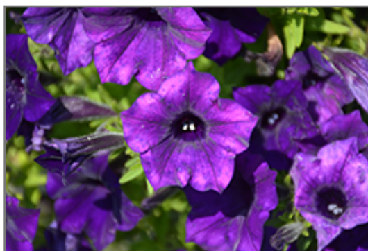
Supertunia Mini Vista Ultramarine Petunia flowers

This plant will require occasional maintenance and upkeep. Trim off the flower heads after they fade and die to encourage more blooms late into the season. It is a good choice for attracting butterflies and hummingbirds to your yard, but is not particularly attractive to deer who tend to leave it alone in favor of tastier treats. It has no significant negative characteristics.