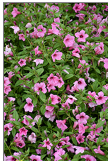
Dekko Maxx Pink Petunia flowers