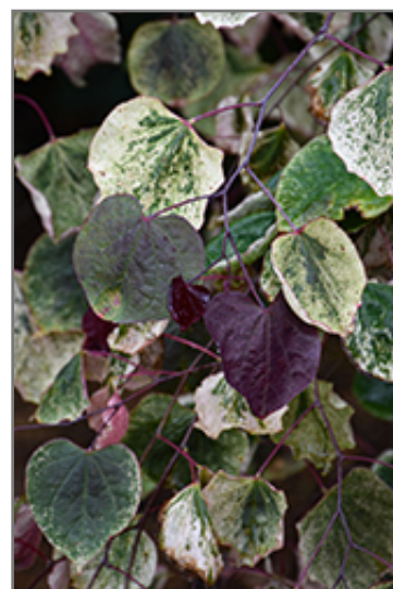
Carolina Sweetheart Redbud foliage