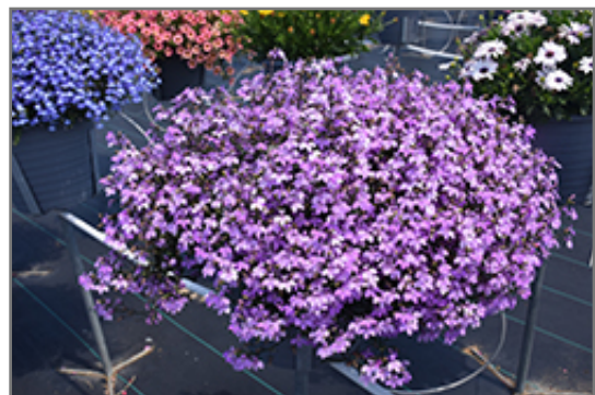
Techno Lilac Lobelia in bloom