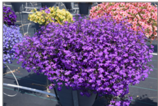
Techno Large Blue Violet Lobelia in bloom