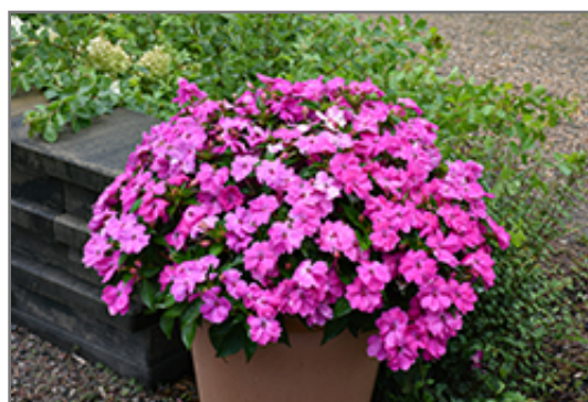
Solarscape XL Pink Jewel Impatiens in bloom