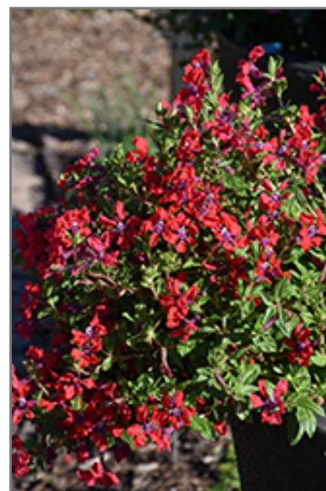
Totally Tempted Watermelon Wine Cuphea flowers