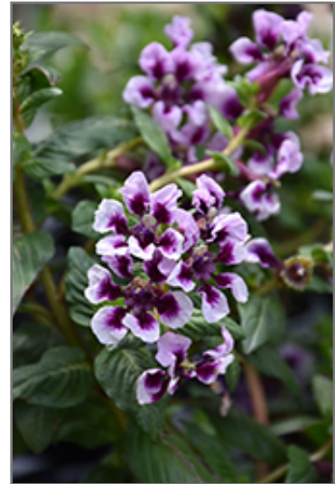
Sweet Talk Lavender Splash Cuphea flowers

Sweet Talk Lavender Splash Cuphea is recommended for the following landscape applications;