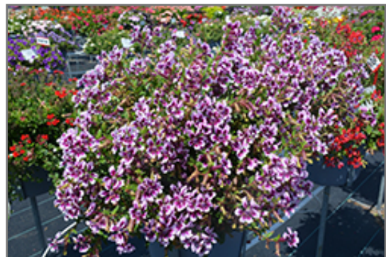
Sweet Talk Lavender Splash Cuphea in bloom