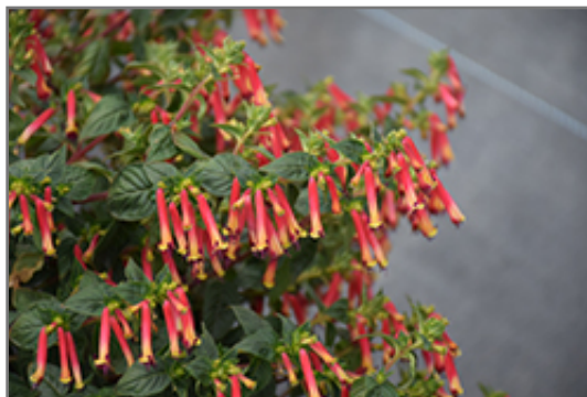
Hummingbird's Lunch Cuphea flowers