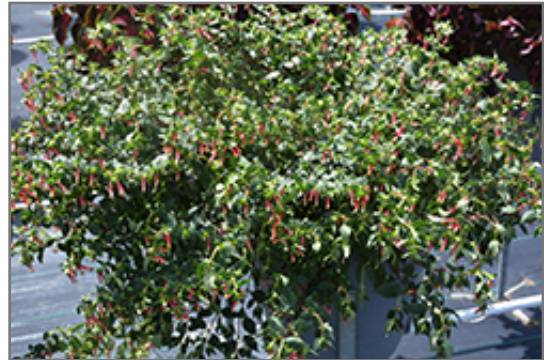
Hummingbird's Lunch Cuphea in bloom

Hummingbird's Lunch Cuphea is a fine choice for the garden, but it is also a good selection for planting in outdoor pots and containers. With its upright habit of growth, it is best suited for use as a 'thriller' in the 'spiller-thriller-filler' container combination; plant it near the center of the pot, surrounded by smaller plants and those that spill over the edges. It is even sizeable enough that it can be grown alone in a suitable container. Note that when growing plants in outdoor containers and baskets, they may require more frequent waterings than they would in the yard or garden.