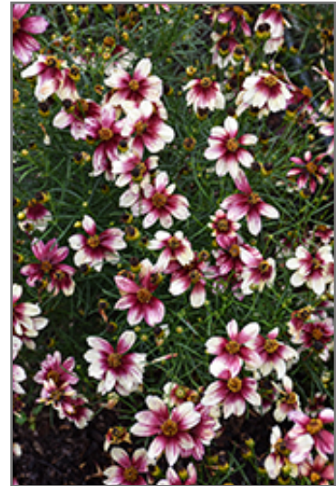
Sizzle And SpiceZesty Zinger Tickseed flowers

Sizzle And SpiceZesty Zinger Tickseed is recommended for the following landscape applications;