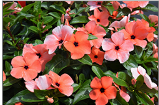
Tattoo Orange Vinca flowers

This plant will require occasional maintenance and upkeep, and should not require much pruning, except when necessary, such as to remove dieback. It is a good choice for attracting butterflies to your yard, but is not particularly attractive to deer who tend to leave it alone in favor of tastier treats. It has no significant negative characteristics.