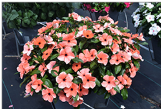
Tattoo Orange Vinca in bloom

Tattoo Orange Vinca is a fine choice for the garden, but it is also a good selection for planting in outdoor containers and hanging baskets. It is often used as a 'filler' in the 'spiller-thriller-filler' container combination, providing a mass of flowers against which the thriller plants stand out. Note that when growing plants in outdoor containers and baskets, they may require more frequent waterings than they would in the yard or garden.