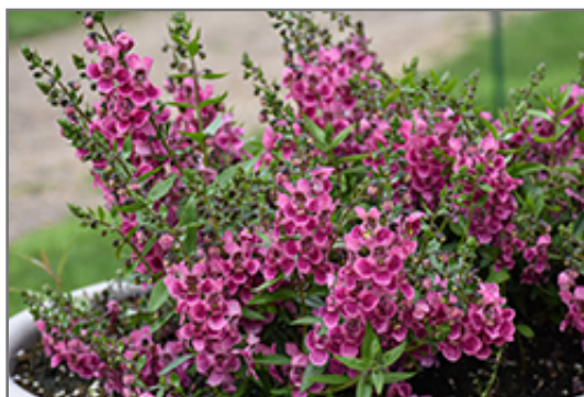
AngelFlare Orchid Pink Angelonia flowers

AngelFlare Orchid Pink Angelonia is recommended for the following landscape applications;