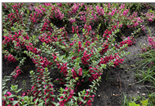
AngelFlare Cranberry Angelonia in bloom

AngelFlare Cranberry Angelonia is recommended for the following landscape applications;