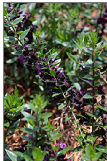
AngelFlare Black Angelonia flowers

AngelFlare Black Angelonia is recommended for the following landscape applications;